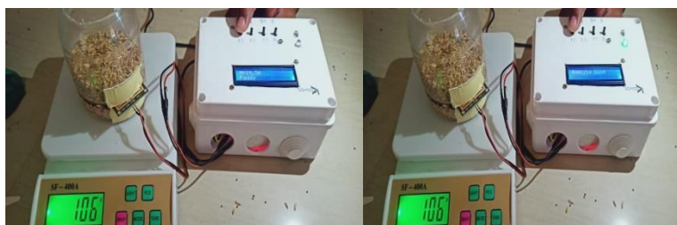
Figure.2 Good Quality of Paddy