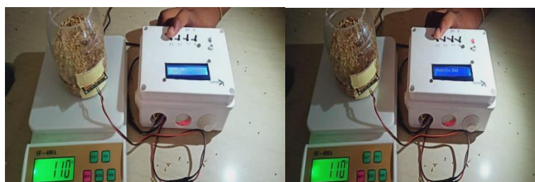
Figure.3 Bad Quality of Paddy